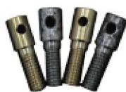
選配：側鑽裝置 Optional: side drilling device